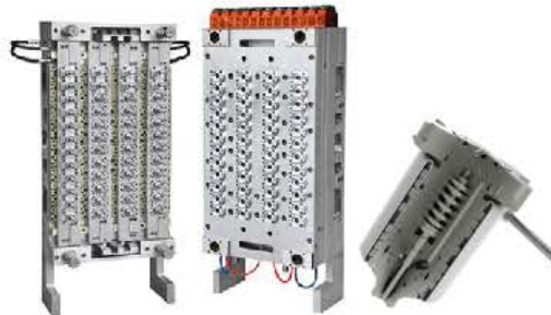
Mold (Hotrunner Systems)

Through many years of market testing, UWA Coil Heaters have achieved support and acknowledgement from many Hotrunner users.